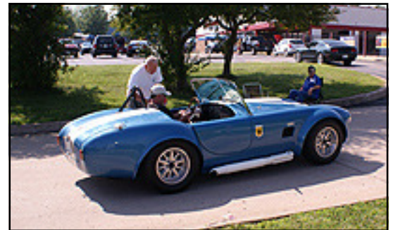
Each club took turns collecting donations as the Blue Oval crowd arrived. The event was really a low work event.

Thanks go out to the Mustang Club of St. Louis for their great support of over 20 Mustang entries. Special thanks go out to Pur Performance for the use of their facility and to the members and families of both clubs for all of their work on this very worthwhile event.