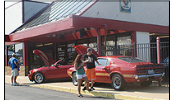
The Pur Performance facility is a great location in central St. Charles County. The store stayed open late for our event.

O ur club, along with the Show-Me Mustang club, held our all Ford Blue Cruise on July 9th. Although somewhat warm, there was a steady breeze and as the sun set, it turned into a beautiful evening.