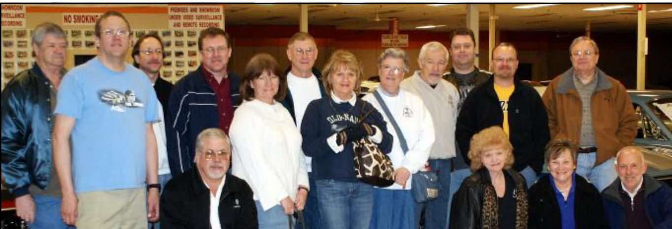
Most of our members were able to stay around for a late photo before we left Gateway.