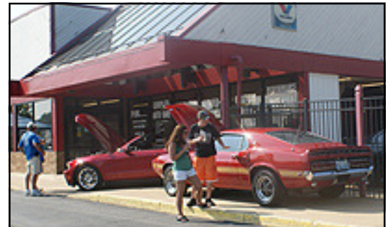
The Pur Performance facility is a great location in central St. Charles County. The store stayed open late for our event.

O ur club, along with the Show-Me Mustang club, held our all Ford Blue Cruise on July 9th. Although somewhat warm, there was a steady breeze and as the sun set, it turned into a beautiful evening.