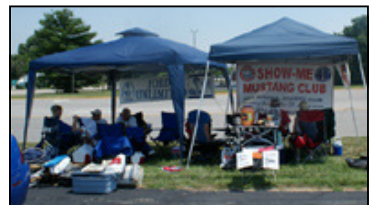
We hooked up shelter halves with the Show-Me Club to keep the warm sun at bay.