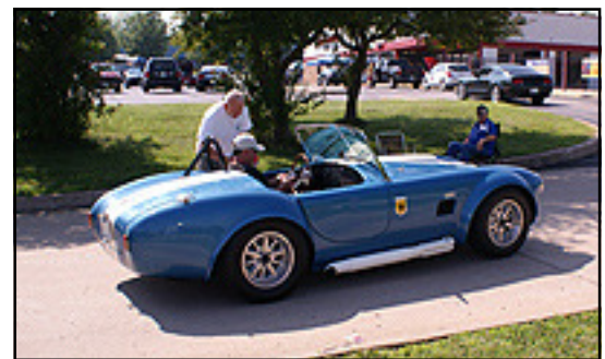
Each club took turns collecting donations as the Blue Oval crowd arrived. The event was really a low work event.

It was a “good news, bad news” kind of day. The bad news was that our car count was down from last year. The good news was that the crowd was quite generous. With outside donations, club donations, 50-50 profit, concessions, and participant donations, we were able to collect over $2,500 to be donated to The BackStoppers. The car clubs shouldered the expense of the DJ and concessions.