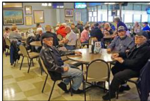
We had over 30 people join us for lunch. Good food and inexpensive drinks $2.25 for a Bloody Mary was a deal.

On April 13th, members, family, and friends of our club caravanned to Perryville Missouri to tour the Missouri National Veterans Memorial. The Missouri's National Veterans Memorial is home to a full-scale black granite sister wall to the Vietnam Veterans Memorial, identical to that on the National Mall in Washington D.C. America's Wall and other outdoor areas offers year-round access, day and night. It's an exact, full-scale replica of the Washington memorial, down to the misspellings of some soldiers' names.