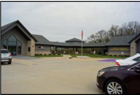
The Wall complex is outstanding. There are many more additions in the planning stages.