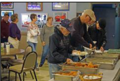
The buffet at the American Legion Post worked out great. For 10 bucks, we had chicken, potatoes, and veggies.