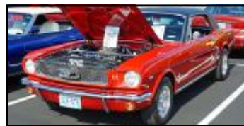
Row 6: Jake Turnipseed Enjoying the beautiful day Bob Layton